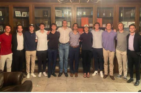
The Executive Board