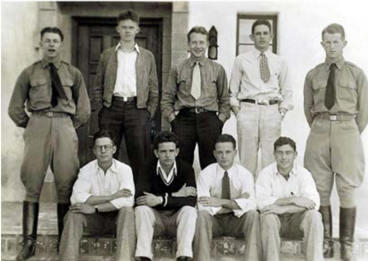
1925 Basketball Team