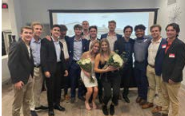
Beta Phi undergrads celebrate not one, but two, Sweethearts of Sigma Chi.