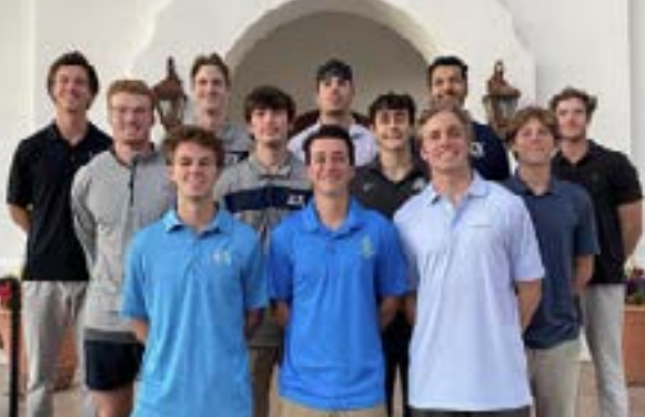
The Executive Board